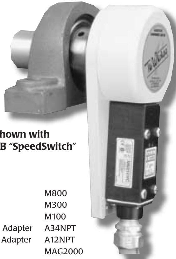
Shown with 4B "SpeedSwitch"

The Whirligig® three-in-one target/bracket/guard makes the installation simple for all standard cylindrical or DIN style inductive sensors. The sensor mounts to the base plate and the complete assembly bolts to the machine's shaft. Machine and shaft vibration does not affect the performance of the sensor, as the whole assembly moves with the shaft. Personal safety is improved since the rotating target is completely enclosed by a tough plastic cover.