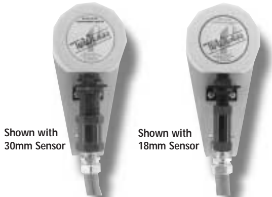
Shown with 30mm Sensor