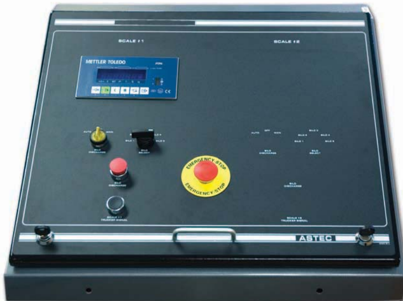
Optional manual control panel for WM2000-PB truck management system.